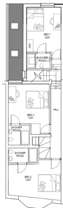
PROPOSED FIRST FLOOR PLAN SCALE 1:100